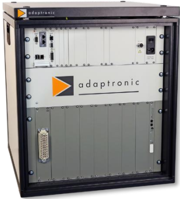
Image: KT 651 with options